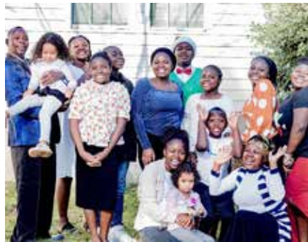
MISSIONS Page 24