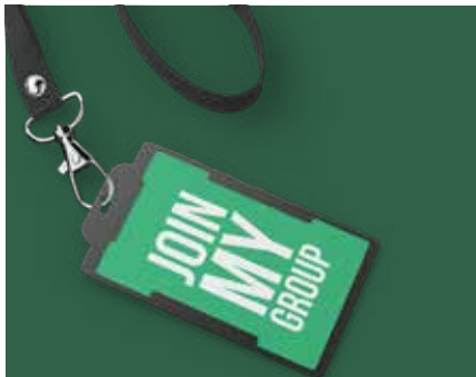
COMMUNITY GROUPS Page 23