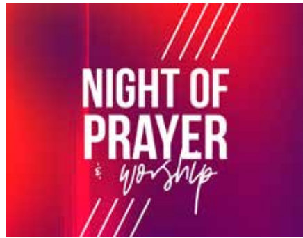
NIGHT OF PRAYER & WORSHIP Page 5