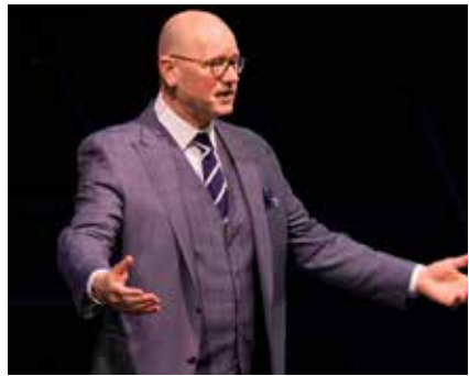
A TRUE SPIRITUAL FELLOWSHIP Page 13