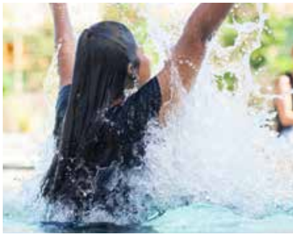
BAPTISM Page 7