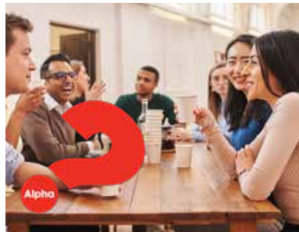
ALPHA Page 16