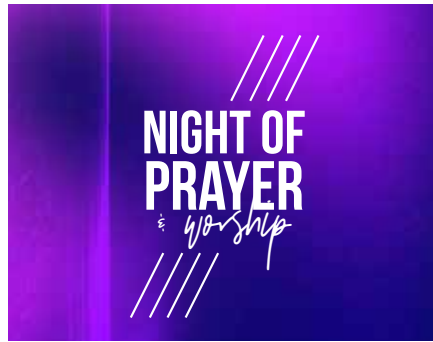
NIGHT OF PRAYER & WORSHIP Page 2