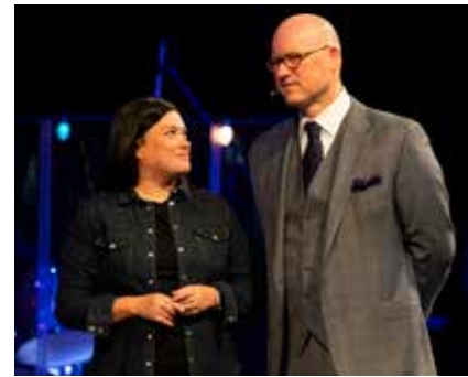
THE ROAD TO HOPE Page 4