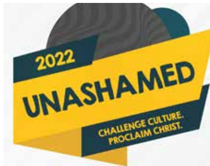
UNASHAMED CONFERENCE 2022 Page 13