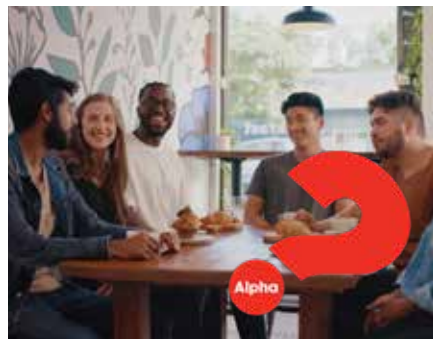
ALPHA Page 8