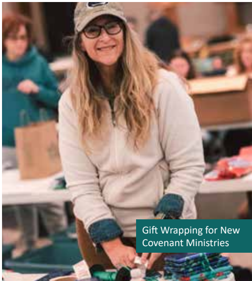
Gift Wrapping for New Covenant Ministries