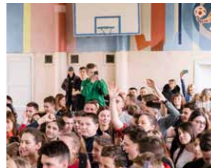
THE GOSPEL MOVEMENT IN UKRAINE Page 14