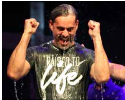
BAPTISM Page 3