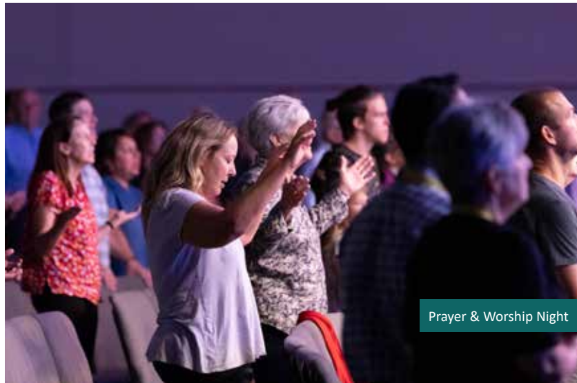
Prayer & Worship Night