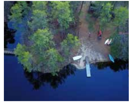
CAMP FELLOWSHIP Page 4