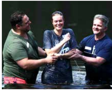
ALL CHURCH PICNIC & BAPTISMS Page 3