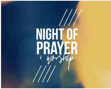
NIGHT OF PRAYER & WORSHIP Page 2