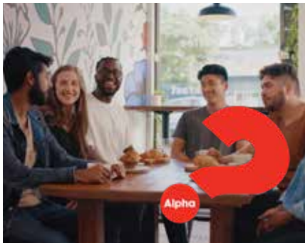
ALPHA Page 7