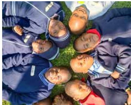
MISSIONS & SERVICE Page 16