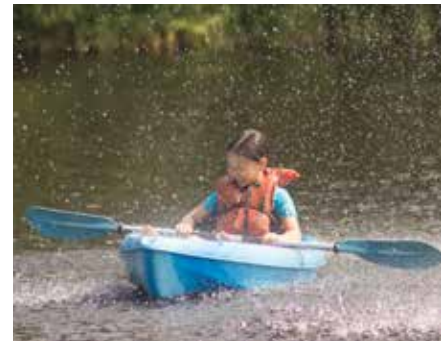
CAMP WIRED | SUMMER DAY CAMP Page 22