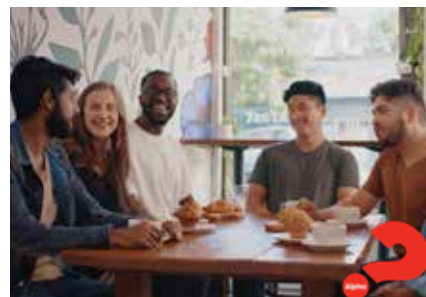
ALPHA Page 16