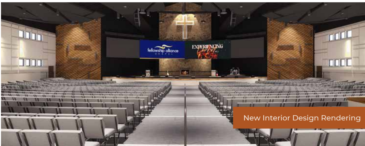
New Interior Design Rendering