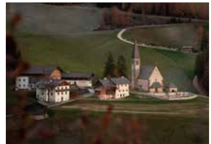
ARTICLE BY PASTOR SETH Page 4