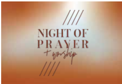
NIGHT OF PRAYER & WORSHIP Page 2