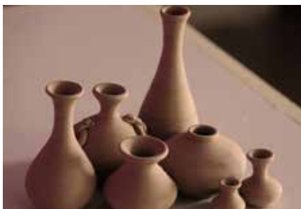
GOD AT WORK IN TRINITY PREP Page 6