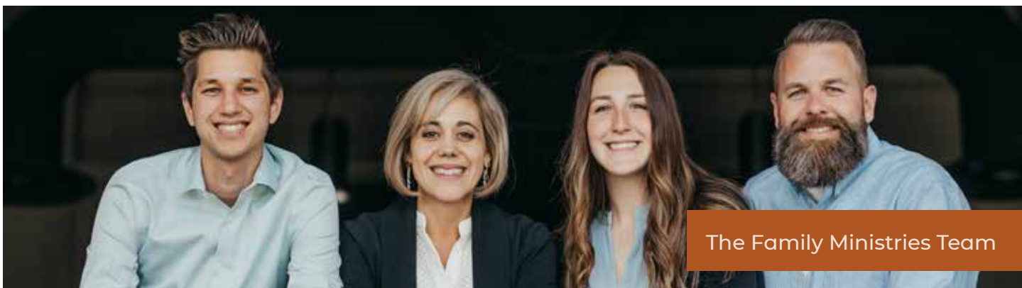
The Family Ministries Team