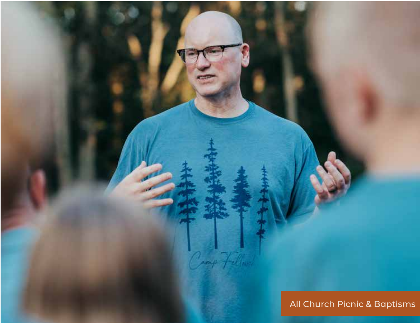
All Church Picnic & Baptisms