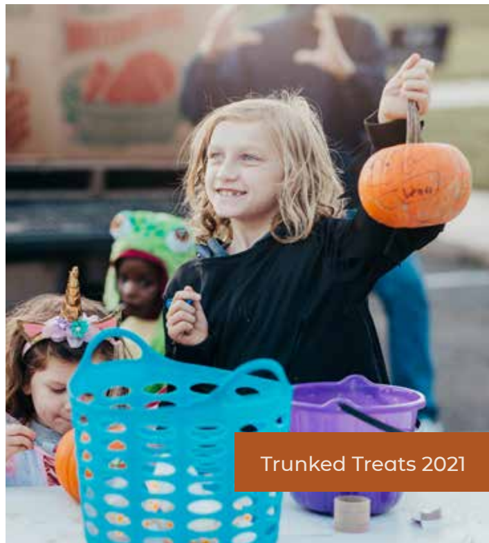
Trunked Treats 2021