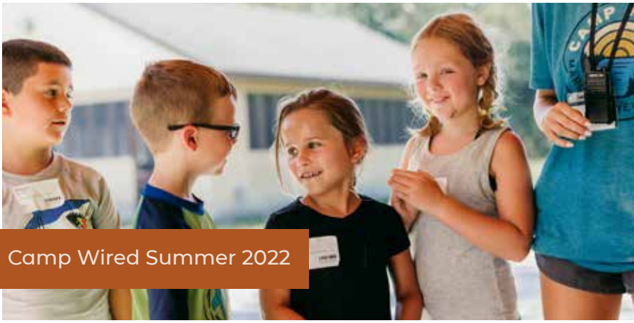
Camp Wired Summer 2022