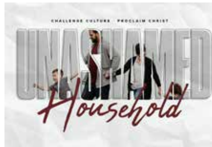
UNASHAMED HOUSEHOLD Page 3