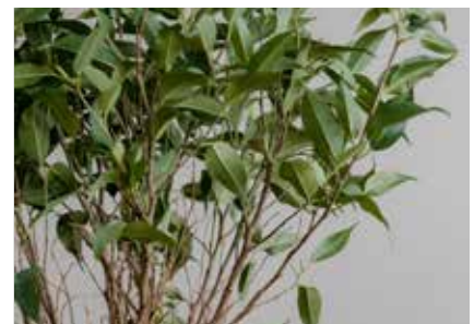
PLANTED Page 16