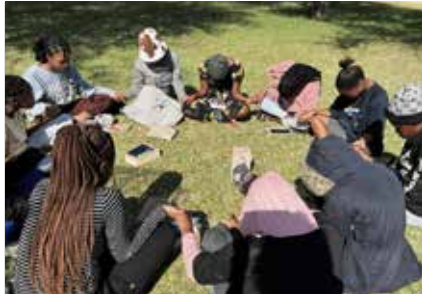
MISSIONS TRIPS Page 24