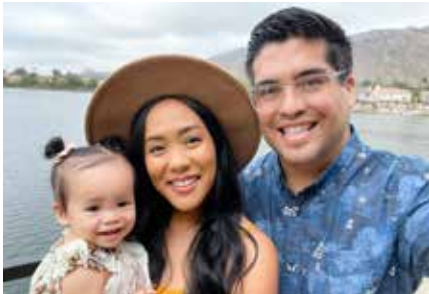
NEW STAFF Page 8