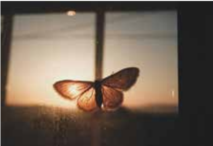
RENEWAL FOR OUR TIMES Page 5