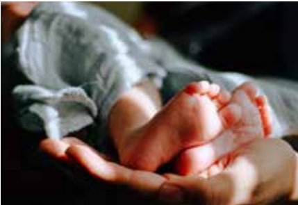
CHILD DEDICATIONS Page 1