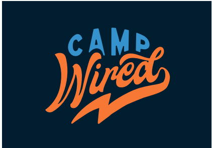
CAMP WIRED Page 4