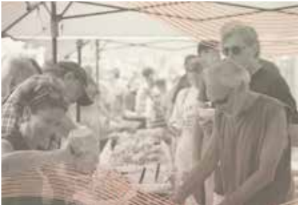
PICNIC & BAPTISMS Page 3